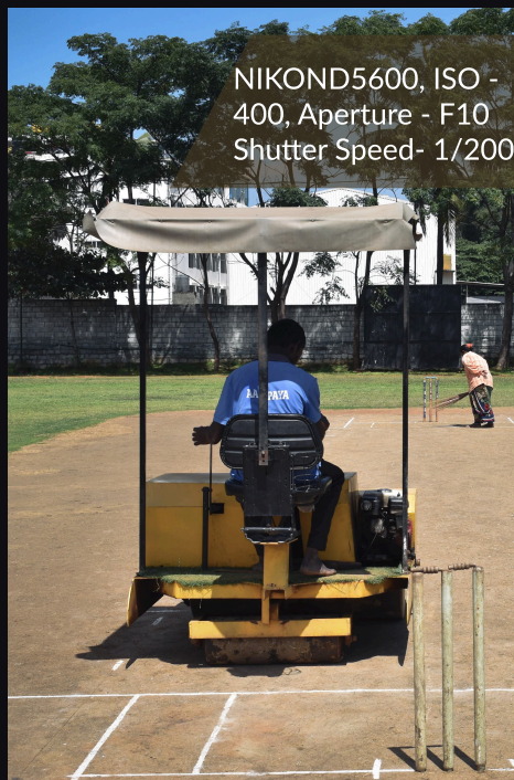
NIKOND5600, ISO - 400, Aperture - F10 Shutter Speed- 1/200

invisible contribution to every athlete's success. These visuals showcase the silent strength of coaches, physios, groundsmen & officials. They are the pillars that hold the spirit of sport upright. Each frame is a tribute to their discipline, passion, and invisible contribution to every athlete's success. The coaches, seen guiding players through football and cricket practice, represent the art of mentorship. With every instruction, correction, and word of encouragement, they shape not only the athlete's performance but also their mindset. Equally vital is the physio, the guardian of recovery. The photograph of an injury being treated mid-game speaks volumes about care and composure under pressure, allowing ath-