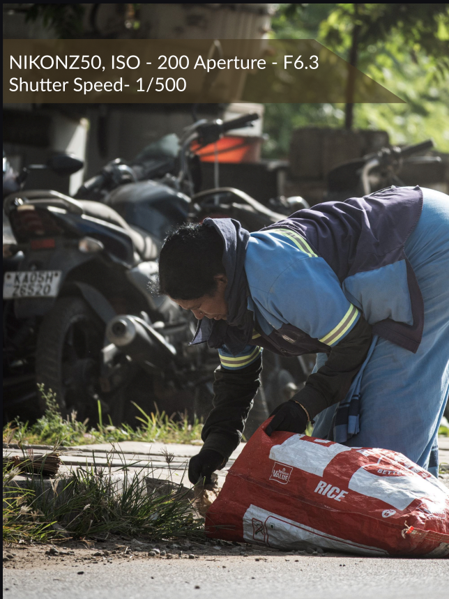
NIKONZ50, ISO - 200 Aperture - F6.3 Shutter Speed- 1/500

Despite the essential nature of their work, these workers face more than physical strain. They carry the burden of social stigma, often branded by the very labour that sustains the community. People continue to litter, spit, and throw waste into public spaces, expecting these same workers to clean it up. There is a silent inequality at play those who keep the city clean are rarely given the respect they deserve. Yet, amid the debris and exhaustion, there is dignity. Conversations reveal quiet humour, teamwork and an