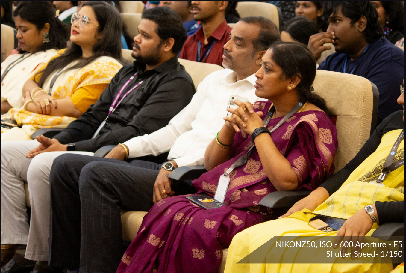
All ears as the chief guest continues his inaugural speech.