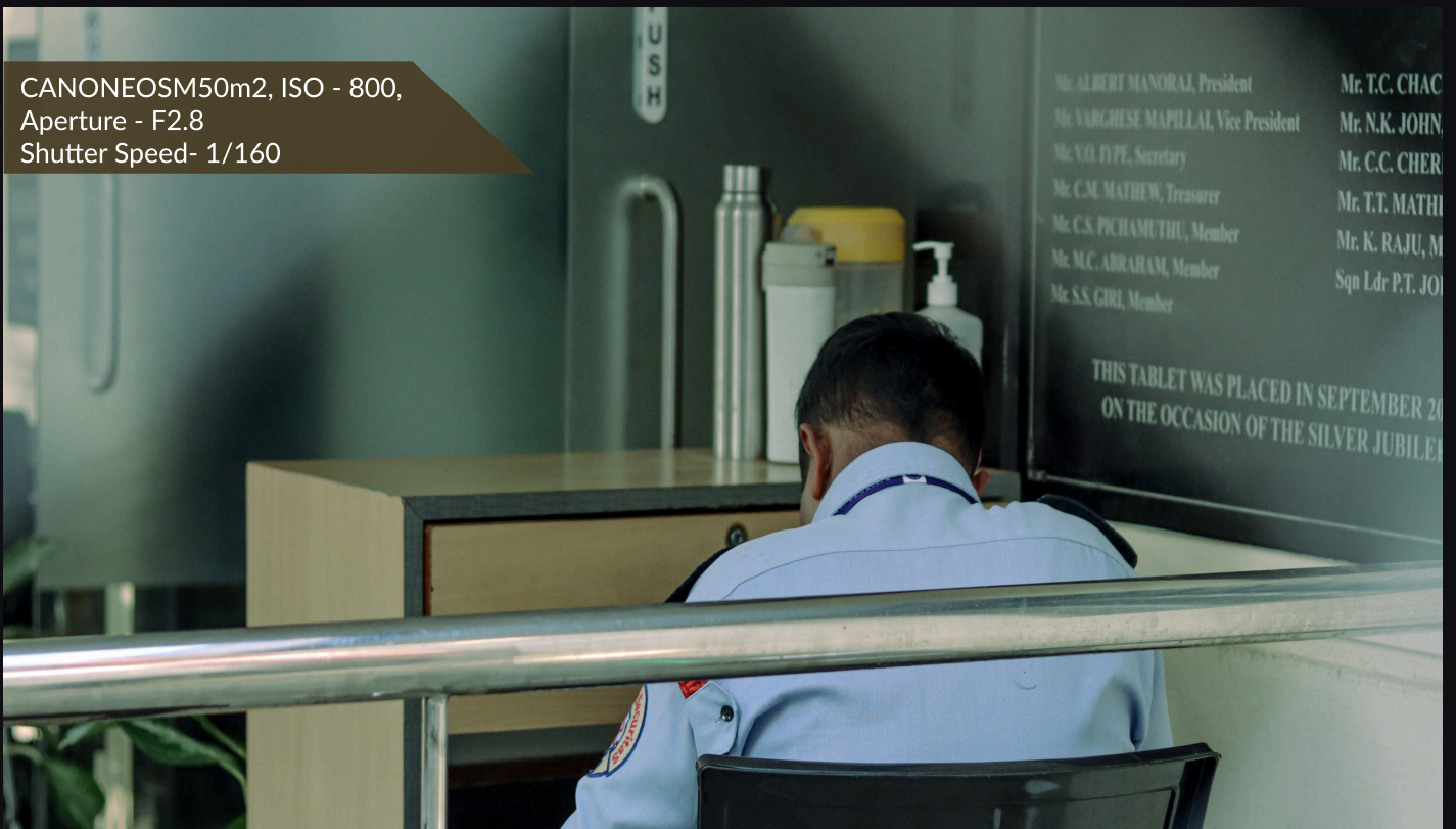
CANONEOSM50m2, ISO - 800, Aperture - F2.8 Shutter Speed- 1/160

Each drop of sweat tells a story of perseverance.