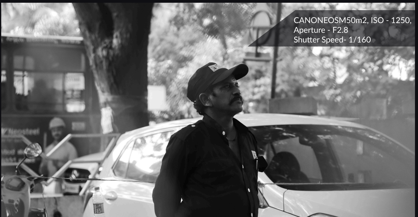
Moments of duty framed in sunlight.

CANONEOSM50m2, ISO - 1250, Aperture - F2.8 Shutter Speed- 1/160