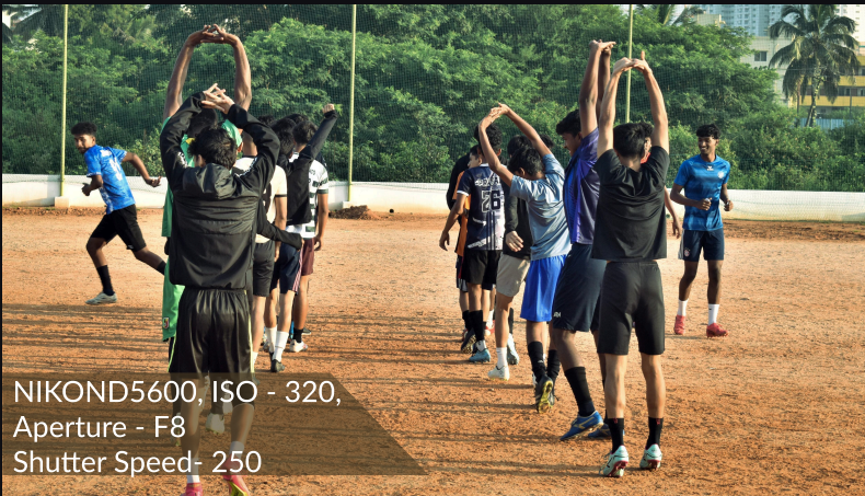
NIKOND5600, ISO - 320, Aperture - F8 Shutter Speed- 250

E Every victory has a story which begins long before the roar of the crowd. From early morning intense drills and practice to recovery sessions, every picture tells a story of the athlete's commitment and dedication. The athletes. Push themselves out of their comfort zone consistently to get better each day. Their commitment is not measured by medals or trophies but by persistence. The silent hours become their motivation, each drop of sweat reflects not just struggle but a promise to rise again, stronger than before. Athletic greatness is often romanticized,