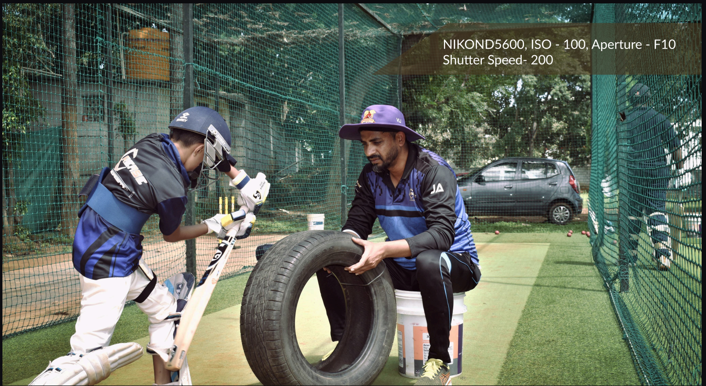
NIKOND5600, ISO - 100, Aperture - F10 Shutter Speed- 200