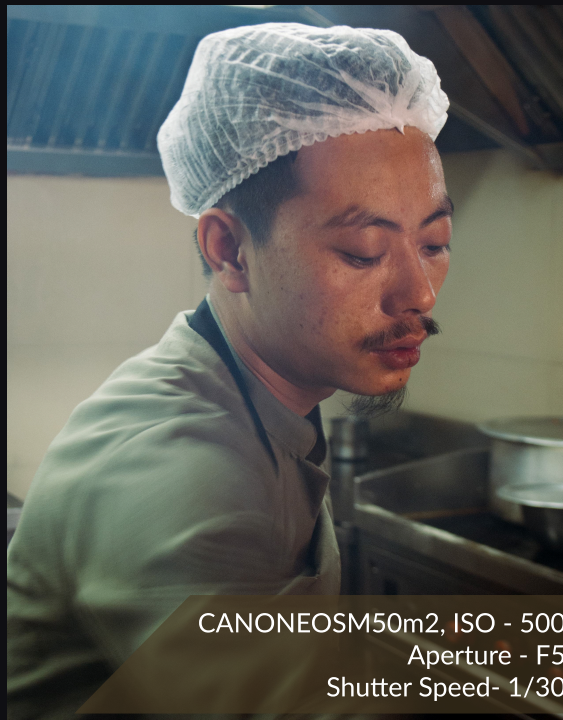
CANONEOSM50m2, ISO - 500 Aperture - F5 Shutter Speed- 1/30

Behind every meal served is a world of movement and relentless heat. Inside the kitchen, effort speaks through the clatter of utensils, the hiss of oil, and the pulse of flames. Cooks and helpers work in sync, measuring time not in minutes but in orders filled and plates sent out. The photographs capture this constant flow — sweat on brows, steam rising from stoves, and faces half-lit by the glow of burners. There is no stillness here, only motion guided by