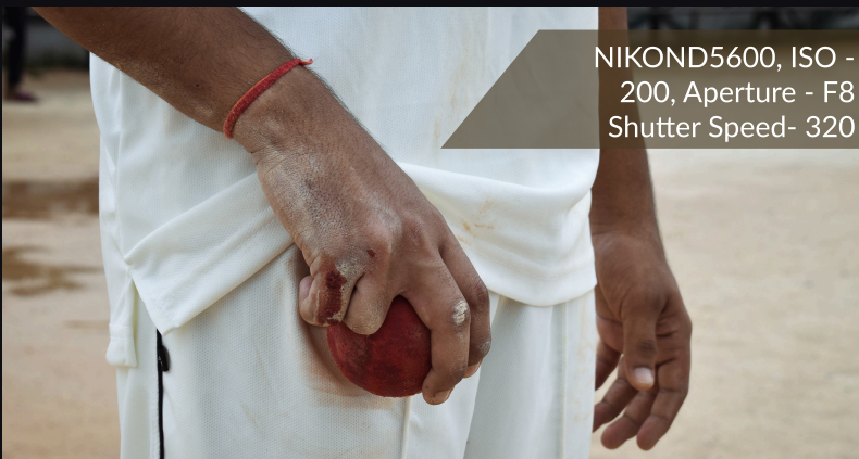
NIKOND5600, ISO - 200, Aperture - F8 Shutter Speed- 320

Beyond the spotlight lies the struggle that builds strength.