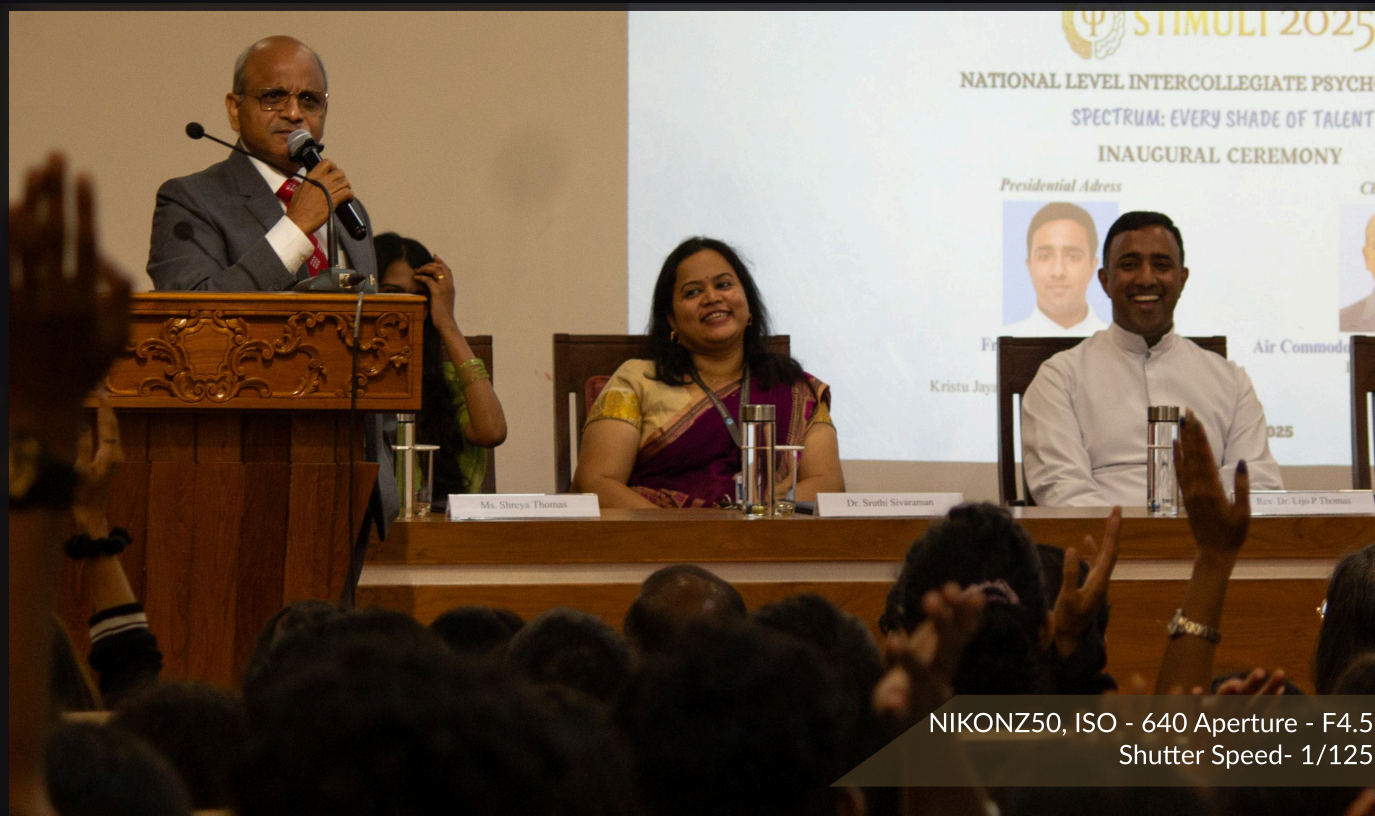
NIKONZ50, ISO - 640 Aperture - F4.5 Shutter Speed- 1/125