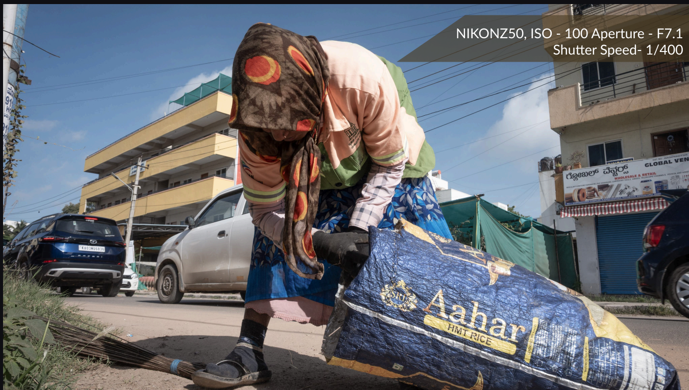
NIKONZ50, ISO - 100 Aperture - F7.1 Shutter Speed- 1/400