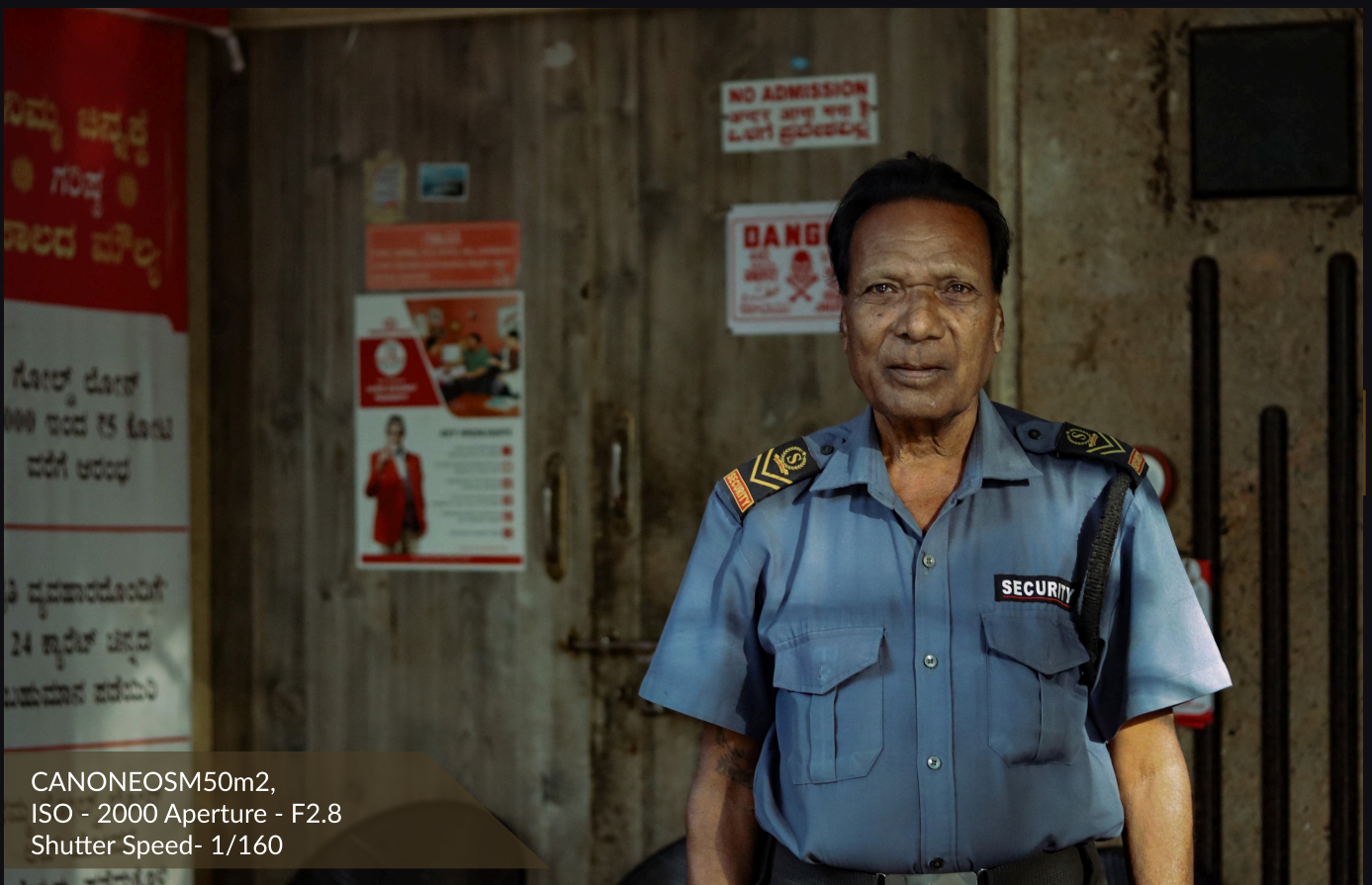
Every uniform carries a story of duty and respect.

CANONEOSM50m2, ISO - 2000 Aperture - F2.8 Shutter Speed- 1/160