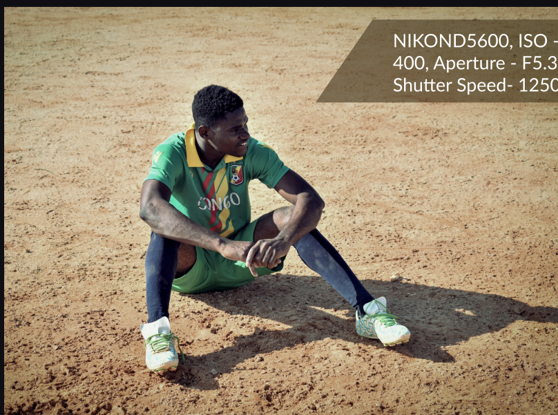
NIKOND5600, ISO - 400, Aperture - F5.3 Shutter Speed- 1250

but 'Beyond the Spotlight' removes the glamour and captures authenticity. It reminds us that sport is not only about winning, but learning to recover and rise up after every fall and failure. The camera becomes a silent witness to their mental and emotional evolution, from frustration to resilience and from injury to renewal. The scars, sweat, tiredness each tell a story and becomes a testament to the price of passion. Their focus is sharp, their emotions pure, even in exhaustion, there is beauty, the beauty of commitment. Every drop of sweat is a step closer to strength.