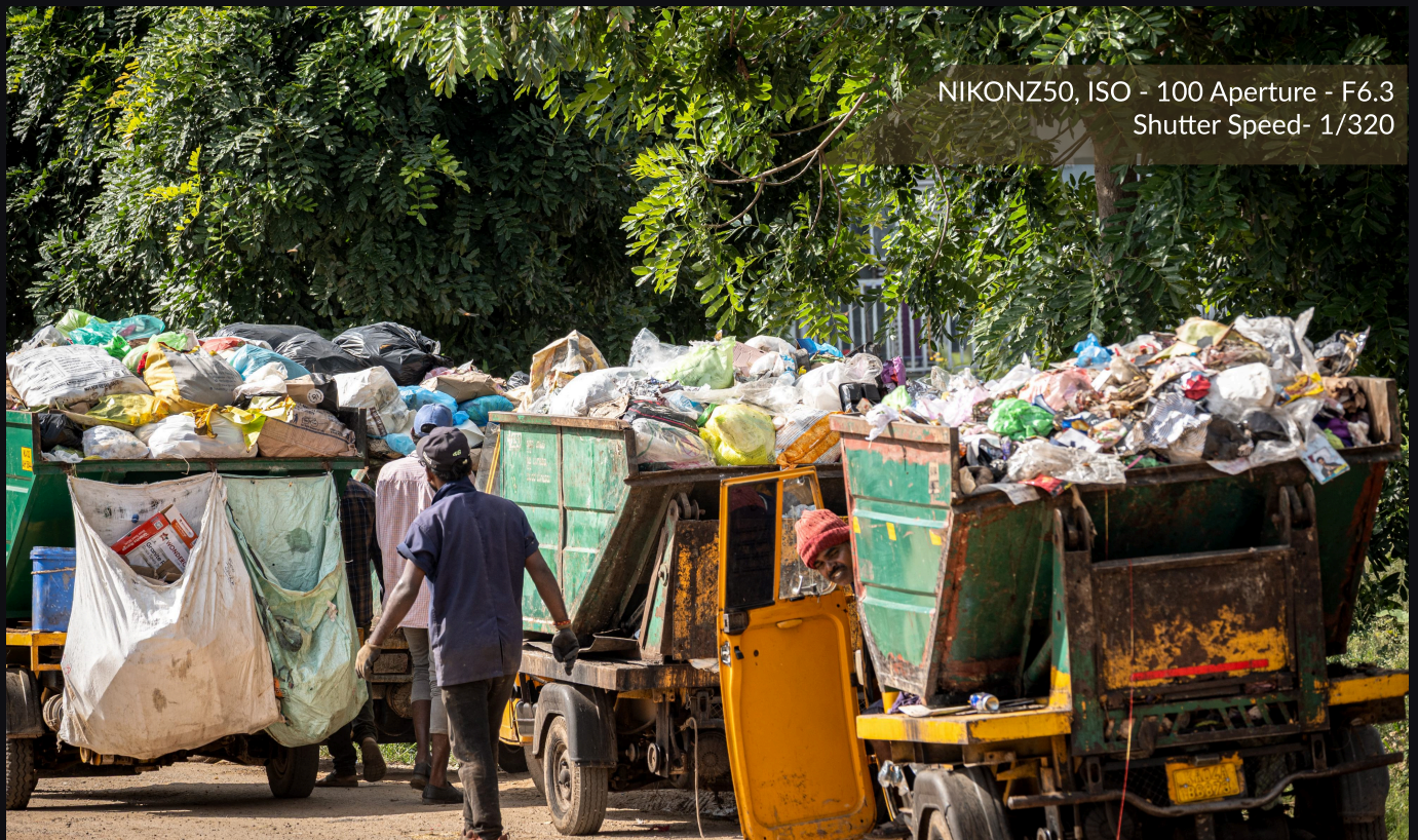
Hands that work tirelessly, holding up the hygiene of millions.

NIKONZ50, ISO - 100 Aperture - F6.3 Shutter Speed- 1/320