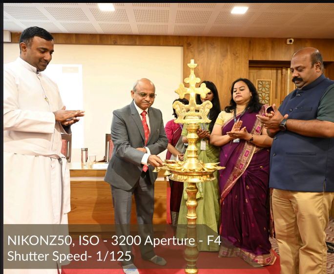
NIKONZ50, ISO - 3200 Aperture - F4 Shutter Speed- 1/125