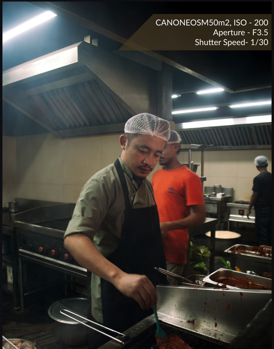
CANONEOSM50m2, ISO - 200 Aperture - F3.5 Shutter Speed- 1/30