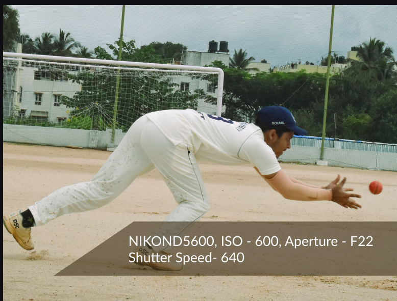
NIKOND5600, ISO - 600, Aperture - F22 Shutter Speed- 640