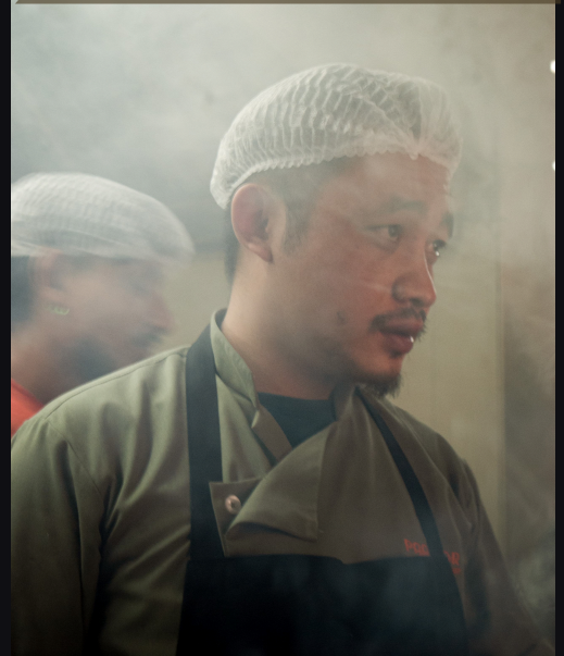
The vision is clouded but the focus remains.