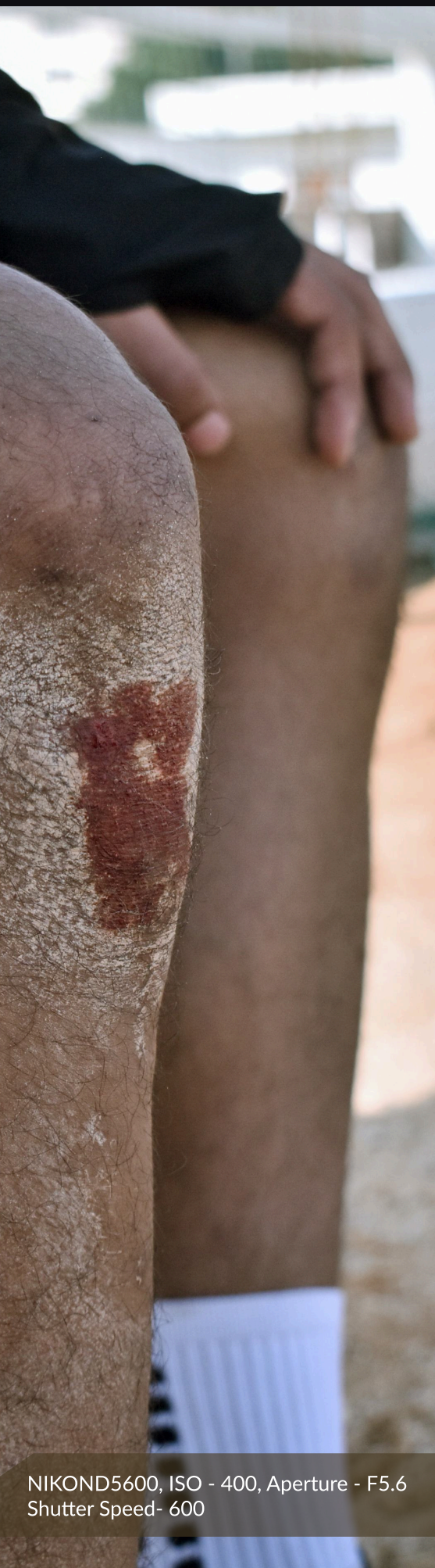
NIKOND5600, ISO - 400, Aperture - F5.6 Shutter Speed- 600