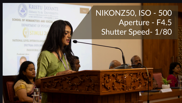
NIKONZ50, ISO - 500 Aperture - F4.5 Shutter Speed- 1/80