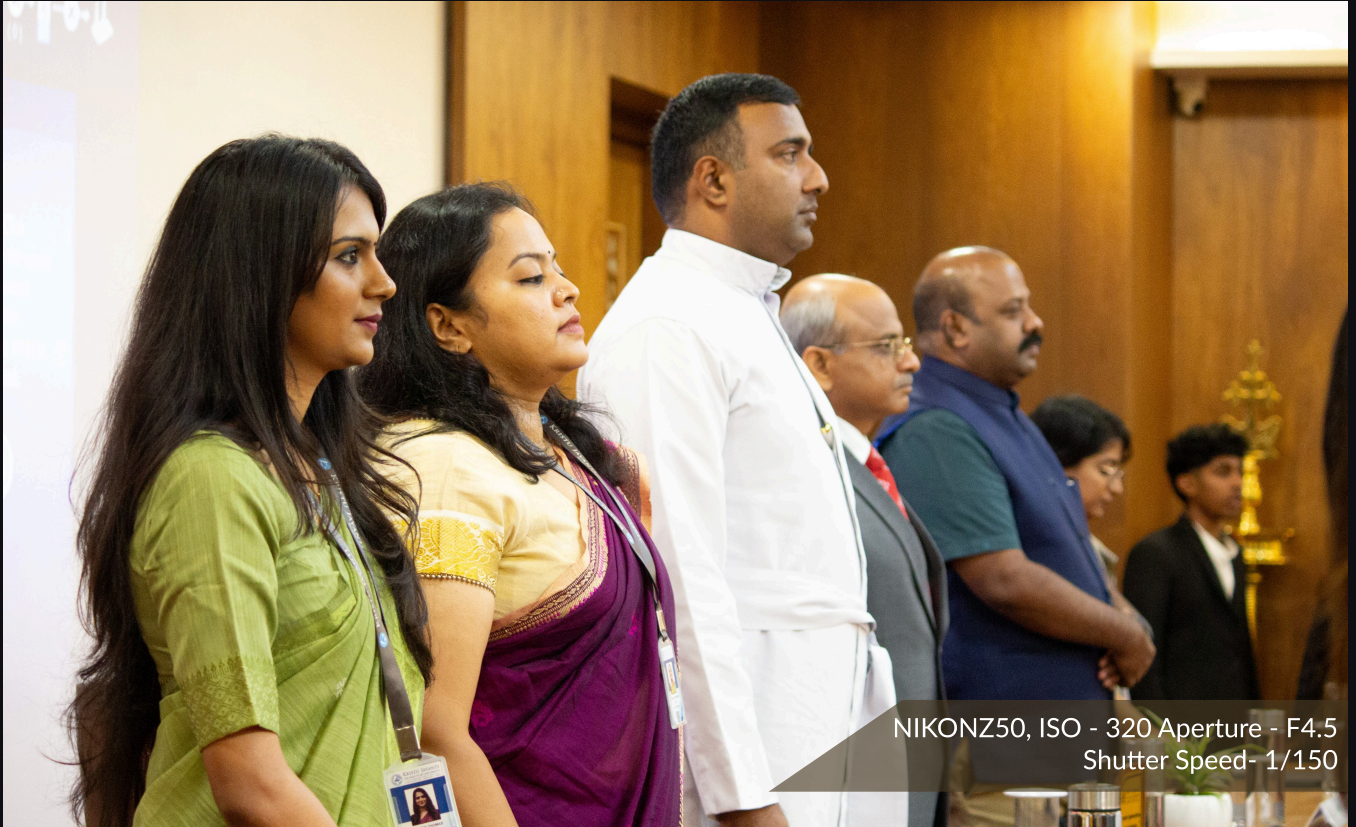
The dignitaries rise for the university anthem.