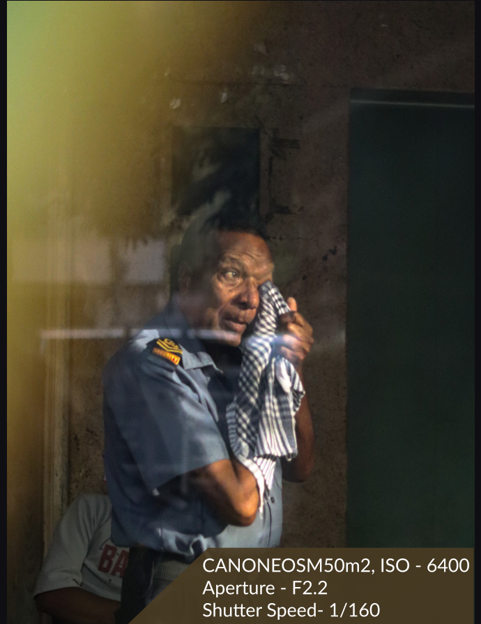
CANONEOSM50m2, ISO - 6400 Aperture - F2.2 Shutter Speed- 1/160

The photographs in this series offer a glimpse into their world moments that often go unnoticed but form the invisible backbone of every institution. Among those who stand guard are women whose calm presence often goes unspoken yet deeply felt. Their watch is as firm as it is composed, their patience as commanding as any uniform. Whether stationed at an entrance or walking a late-night round, they embody both strength and subtlety protectors who balance authority with quiet composure. Behind each uniform lies a story of commitment. Long shifts stretch into the night, where time seems slower, yet the mind cannot rest. The hum of passing vehicles, the echo of footsteps in an empty corridor, or the flicker of a distant light