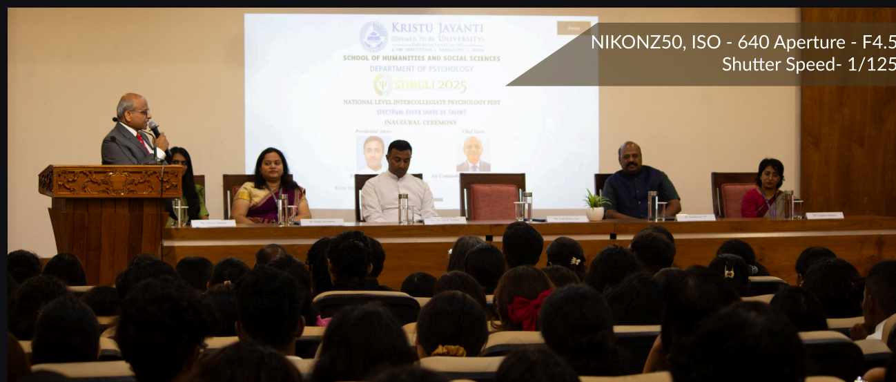
The respected panel of dignitaries.

NIKONZ50, ISO - 640 Aperture - F4.5 Shutter Speed- 1/125