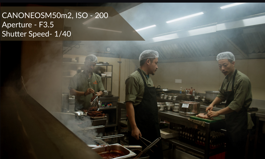
CANONEOSM50m2, ISO - 200 Aperture - F3.5 Shutter Speed- 1/40

Focus-the invisible ingredient that perfects every dish.