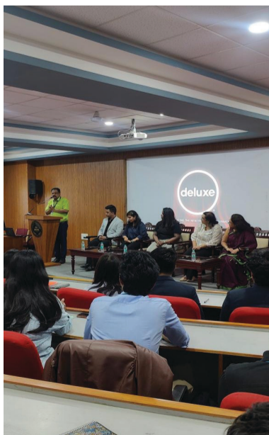
Panel of experts from Deluxe Entertainment

and explained key aspects such as timing, synchronisation, formatting standards, readability and cultural sensitivity. Through presentations, students gained insight into the precision involved in subtitling. On Day 2, the experts focused on practical training. Students installed professional subtitling software and worked on video clips provided by the trainers, applying the concepts discussed during the previous session.