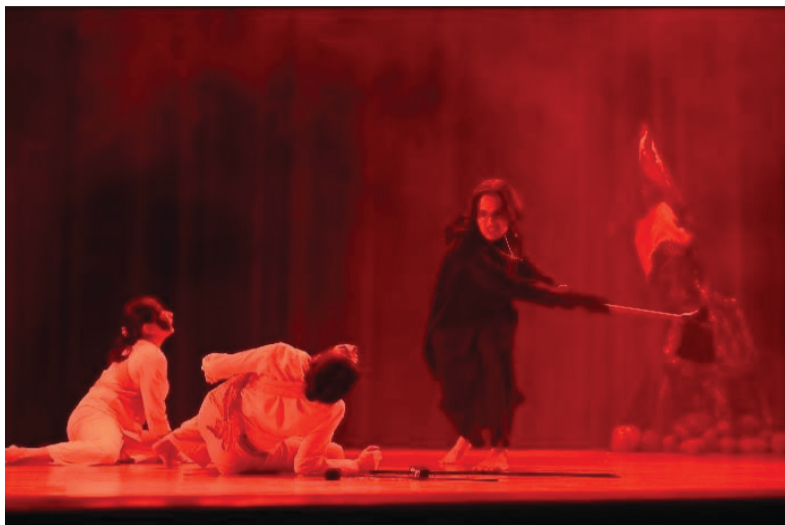
Performance by students of theatre club during Metanoia

The play presents emotions as meaningful responses to life's complexities.